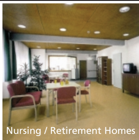
Nursing / Retirement Homes