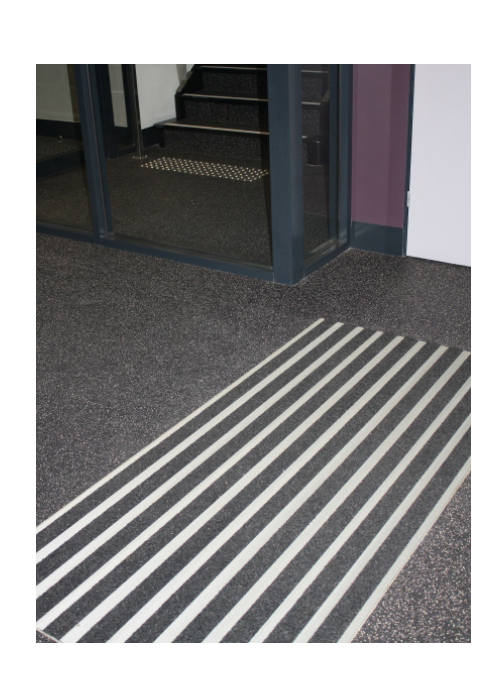
8 Selgar Avenue TONSLEY South Australia 5042

In very brightly lit areas, the strong contrast between light aluminum scraper and a dark wiper strip can sometimes create a strobe effect, which should be avoided. To prevent this occurrence, consider using scraper bars in Black Anodized Aluminum