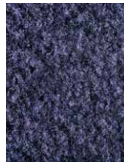
PSE 609 PURPLE