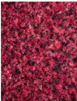
PSE 601 RED