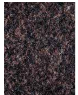
PSE 605 BROWN