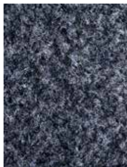
PSE 607 ANTHRACITE