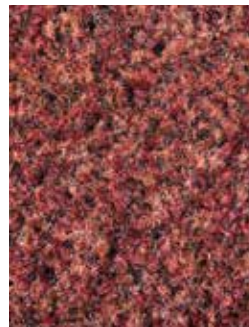
PSE 603 RUST