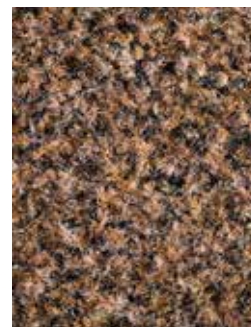
PSE 604 COCOA