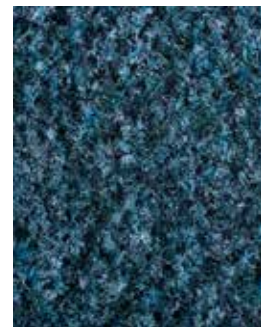
PSE 610 TORQUOISE