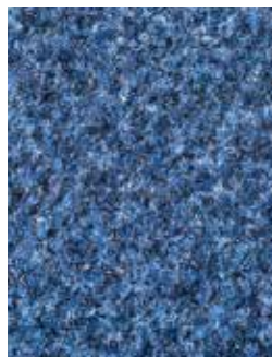
PSE 602 BLUE