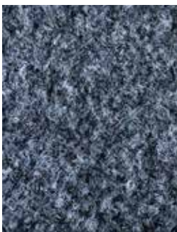
PSE 606 GREY