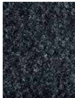
PSE 608 BLACK