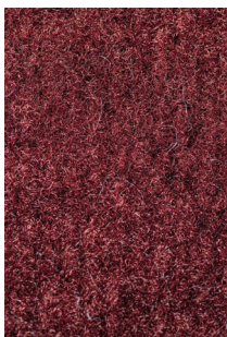
RED OCHRE 3012